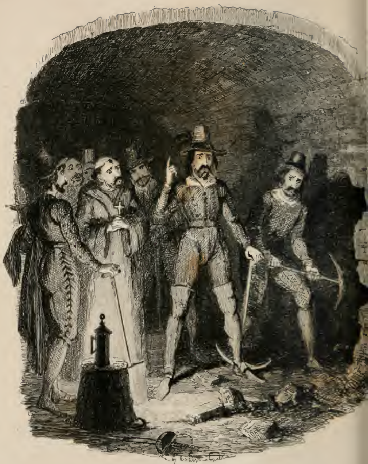
They found out the other way and the whole thing was over